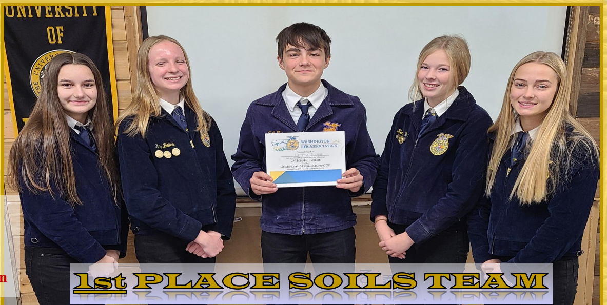
1st PLACE SOILS TEAM